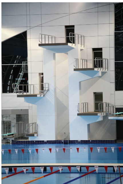
SA Aquatic Centre

The competition is open to spectators and will kick off with a short ceremony at 9am on Friday and runs through until 6pm on the first two days, with a 5pm close on Sunday.